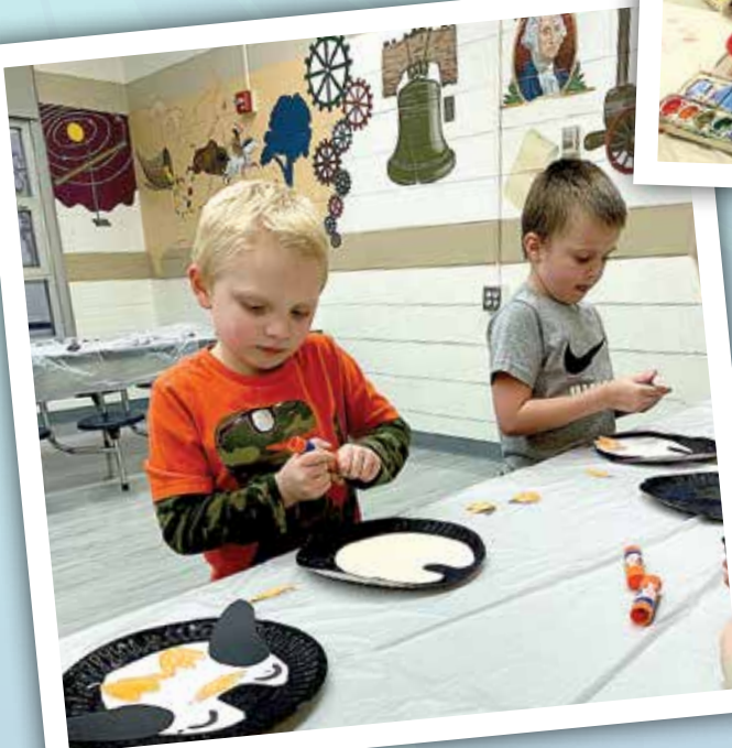
Paper penguin creations