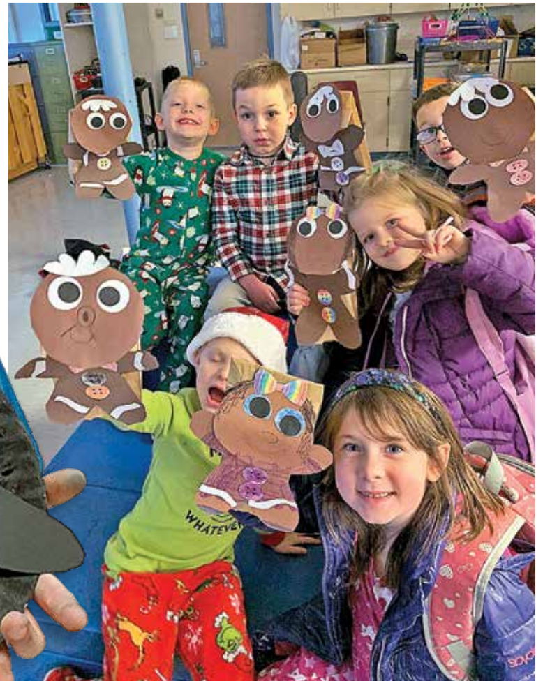
Students show off their latest creations: gingerbread puppets