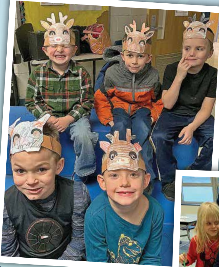
Young reindeer visit our classroom